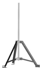
Universal Tripod Mount, 2-3/8 in OD x 96 in pipe