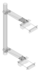
Pipe Mount Taper Kit