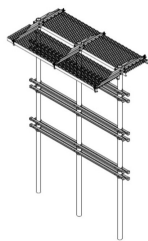
H-Frame with Ice Canopy, 8ft long with 3 Posts