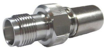
TNC Female for CNT-400 braided cable