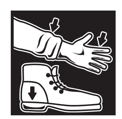
Wear shoes with rubber soles and heels. Wear protective clothing including a long-sleeved shirt and rubber gloves.