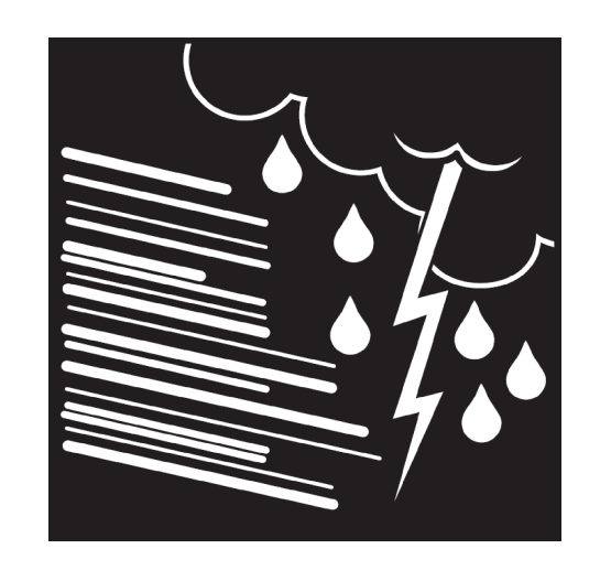
Do not install on a wet or windy day or when lightning or thunder is in the area. Do not use metal ladder.