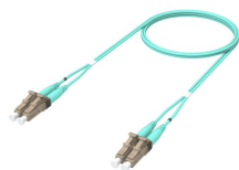
Fiber Optic Patch Cord, Duplex, Multimode, LC/UPC to LC/UPC, aqua, 20 m