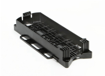
DLX® Mini-MST, Fiber Optic Universal Mounting Bracket