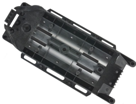
MST, Fiber Optic Universal Mounting Bracket, 2/4 port